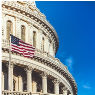
The $2 trillion emergency relief package represents a bipartisan effort intended to assist individuals and businesses during the ongoing coronavirus pandemic and accompanying economic crisis.